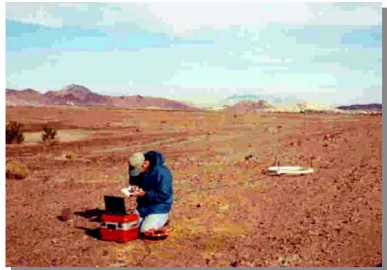
GEONICS EM-47 TDEM SYSTEM

The scope of work included the following: