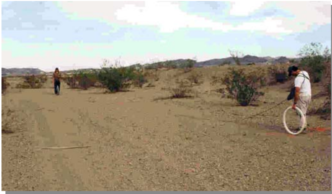
GEONICS EM-34 TERRAIN CONDUCTIVITY METER

Geophysical Instruments used during this investigation included the Geonics EM-31 and EM-34 terrain conductivity meters, Geonics EM-47 TDEM system and Mount Sopris MGX II digital logging system with a Geonics EM-39 EM induction probe.